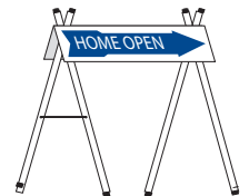
6" x 24" Arrow Only $29.95 Ea. (min. 3)