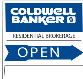
24" x 24" Generic CN4 w/ Writing Area (min. order 3)